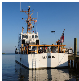
Deepwater Horizon Response May 2010

Here at Sage, we would be interested to hear how your business has been affected by the spill and what steps you've taken to reduce the impact and recover, so please post a comment or send us an email. And we'll keep you posted on what Sage employees are doing to help.