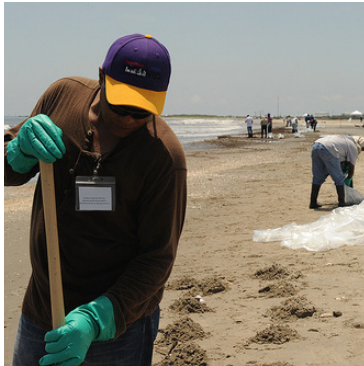
Deepwater Horizon Response - May 2010

Since April 20, 2010, the massive oil spill in the Gulf of Mexico has been a major focus of the morning, afternoon, and evening news. We've all seen video feed of the flow, the efforts to contain the oil and the dramatic effects of the spill on the wildlife, marshes, and beaches. What hasn't been made quite so obvious, however, is the effect this crisis is having on small businesses all across the Gulf. We've already talked with at least one Sage Peachtree customer who's been affected.